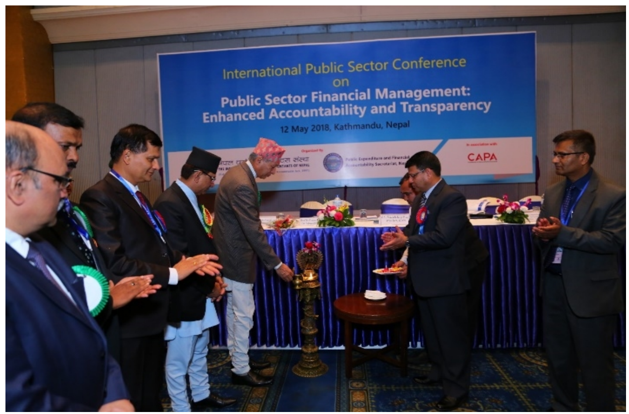
Inauguration by Finance Minister

Speaking at the inauguration ceremony, Finance Minister briefed about the present situation of Public Financial Management (PFM) and its relation with the fiscal policies and budget. He especially highlighted the role of professional accountants to develop and enforce the instruments for better management of government's revenue and expenditure by establishing a stringent system of control for combating corruption. He further highlighted the need to frame institutional and policy frameworks for sound PFM particularly in the context of present federal setup where the Local and Provincial Governments have been entrusted with role of collecting revenue and spending budget.