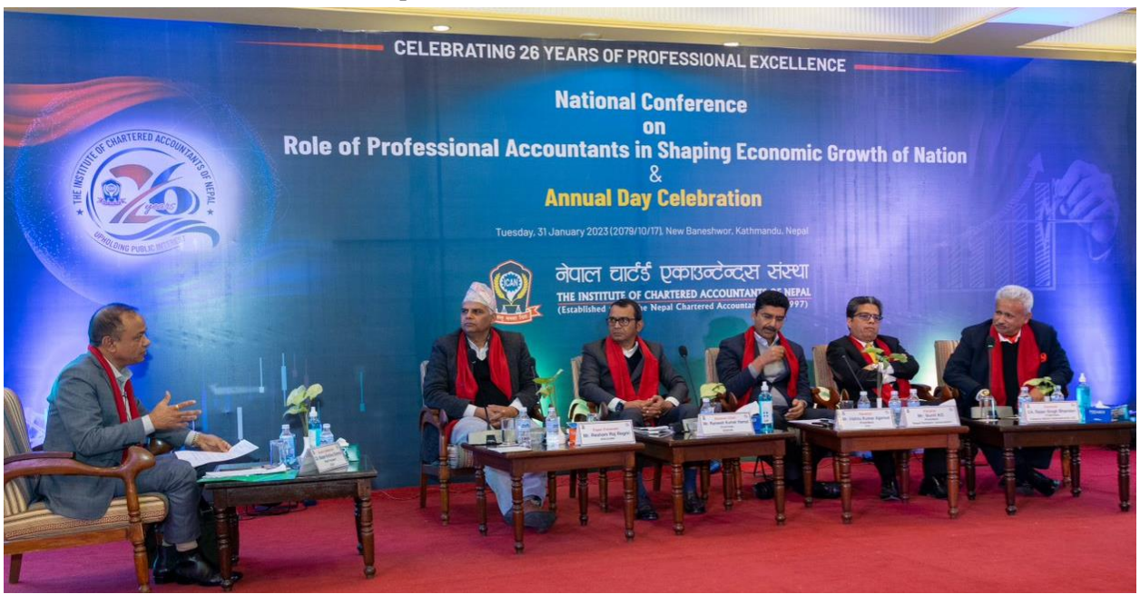
Panel Discussion on "Accounting Profession for enabling Corporate Governance"

include private sectors and venture capital in the bracket of corporate governance in-order-to attract foreign investment for the sustainable development of the nation.