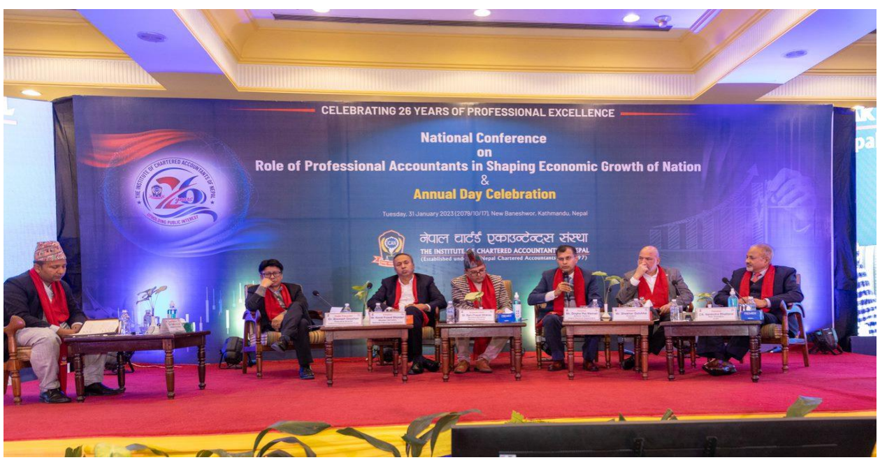
Panel Discussion on "Role of Accounting Profession on National Revenue and GDP"

Lastly, the Chair of the Conference summed up the key deliberations of the panelists and highlighted government's support to ICAN for integrating the role of professional accountants in the economic development of nation.