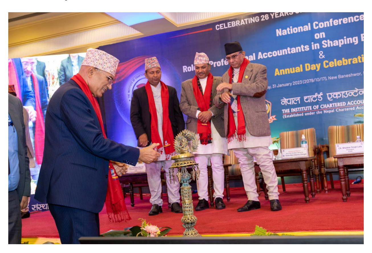
Hon'ble Deputy Prime Minister and Finance Minister, Mr. Bishnu Prasad Paudel inaugurating the program

The program was inaugurated by Chief Guest of the program by lighting up the Panas . He delivered his speech congratulating the Institute for celebrating its 26 years of establishment and role of the Institute for economic development of the Nation.