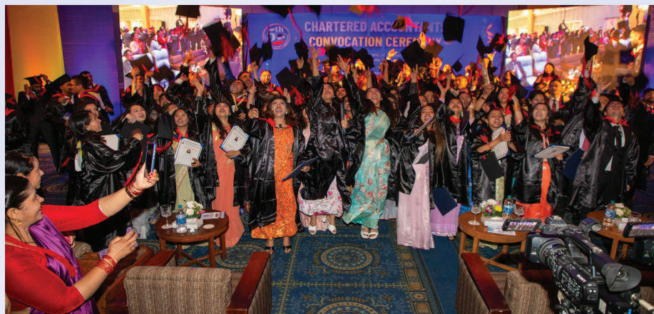
Figure: Recently Qualified Chartered Accountants Celebrating their Convocation Ceremony