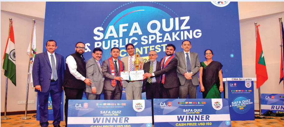
Figure: Student receiving award for securing Winner position in the recently concluded SAFA Quiz Contest 2024

Further, students of ICAN participate in various National and International Conferences organized by Professional Accounting Organizations of SAFA level i.e., India, Bangladesh, Pakistan and Sri Lanka.