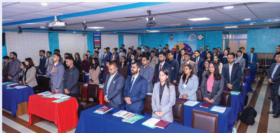
Figure: General Management and Communication Skills (GMCS) Training