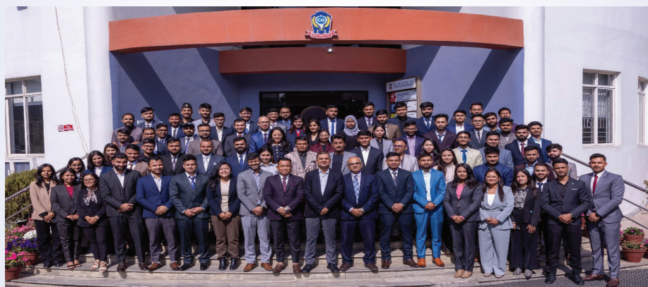
Figure: General Management and Communication Skills (GMCS) Training