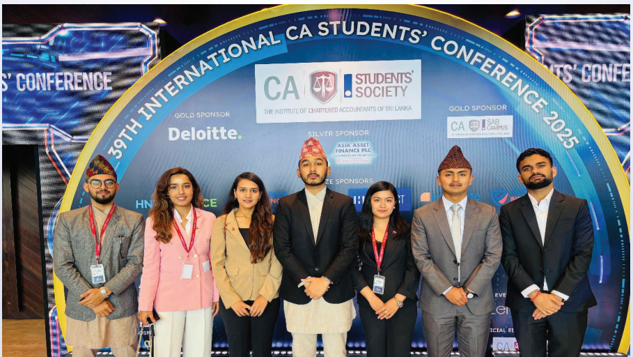
Figure : Students Participating in International Conference at Sri Lanka