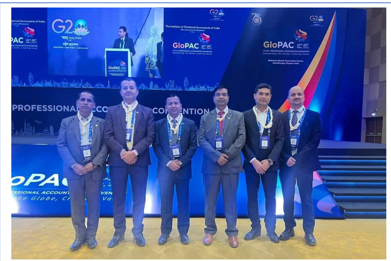
Glimpse of ICAN Delegation participation in the GolPAC held in Gujarat, India