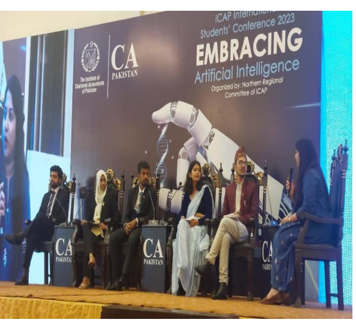
Glimpse of International Students' Conference held at Pakistan.