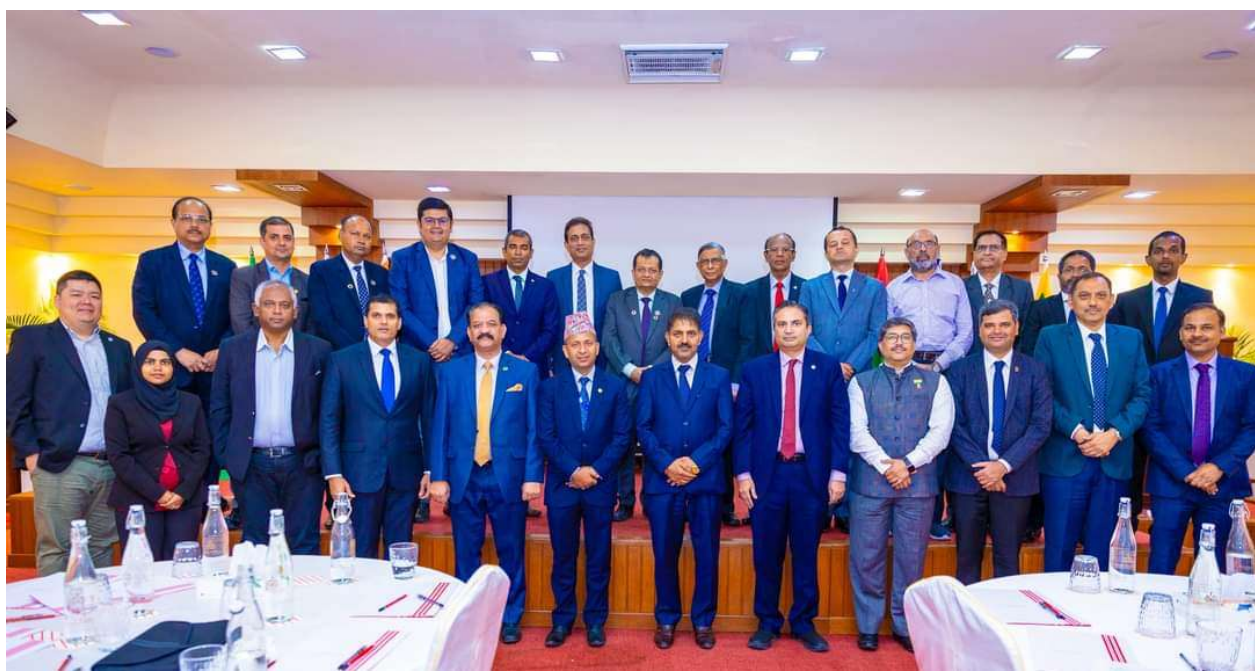
Group photo of delegation from SAFA member bodies including Nepal, India, Sri Lanka, Bangladesh, Pakistan and Maldives during celebration of SAFA Foundation Day Celebration on 22 nd August 2023