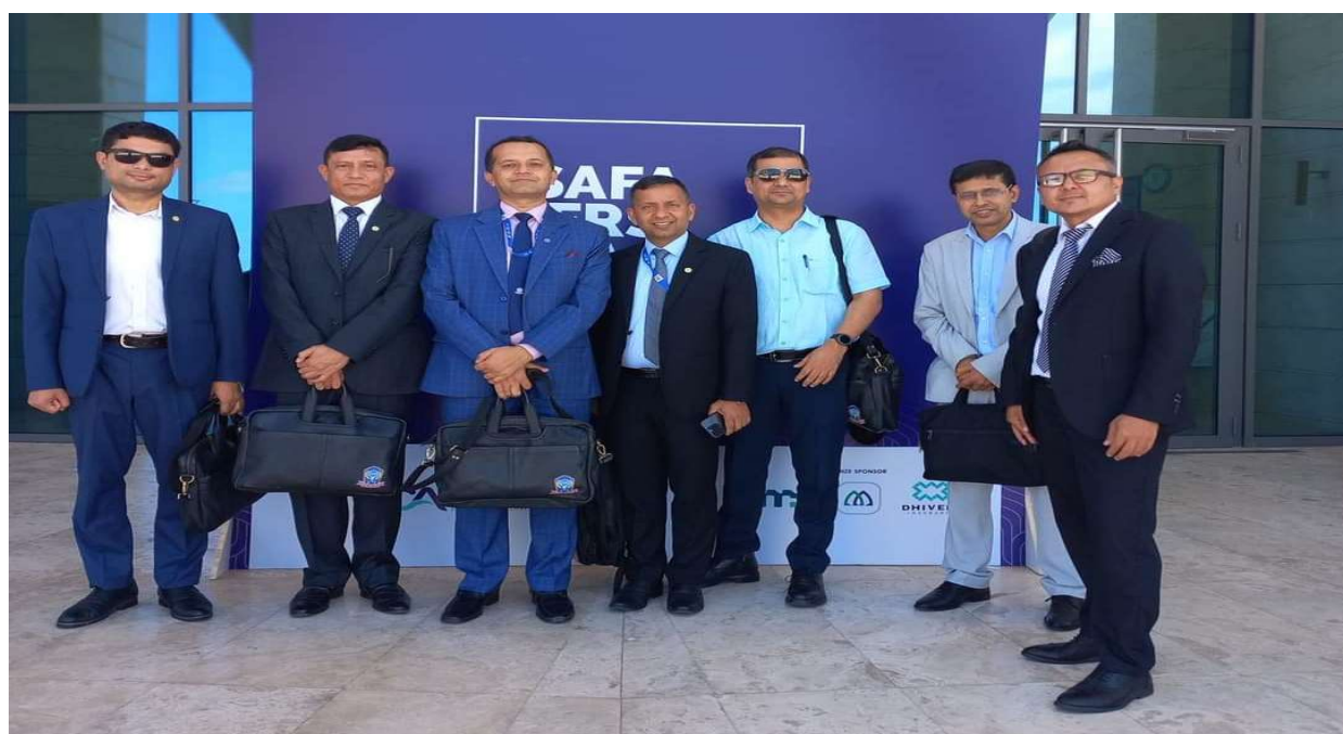
Glimpse of delegation from Nepal participating in the SAFA IFRS and IASs Forum 2023 in Maldives