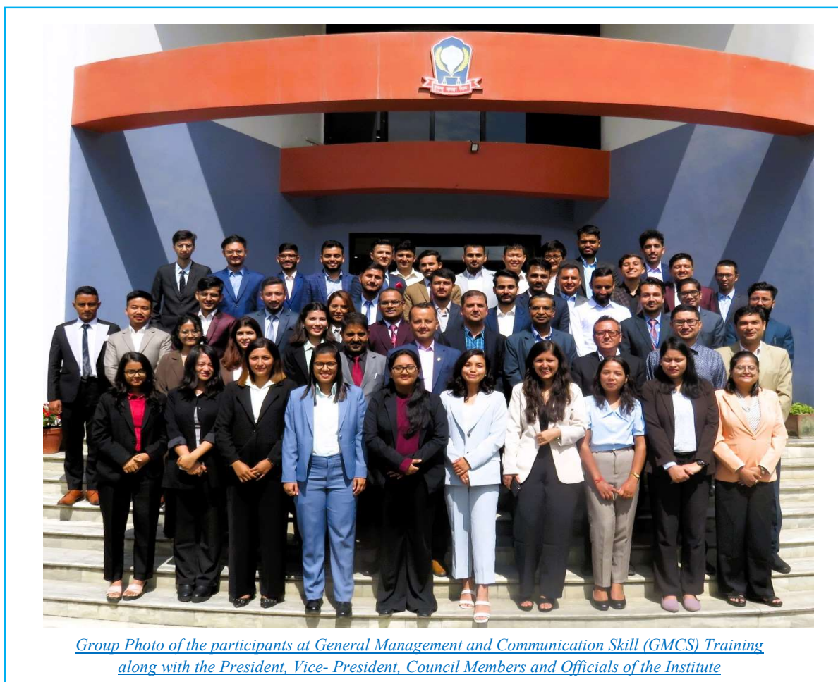
Group Photo of the participants at General Management and Communication Skill (GMCS) Training along with the President, Vice- President, Council Members and Officials of the Institute

The aim of the training program was to enhance communication, presentation, and interpersonal skills and to provide understanding of contemporary business environment and opportunities and help the students to prepare for a career either in employment or in practice by adopting the changes required to be competitive in their professional life. Participation in this training is a pre-requisite for obtaining membership of the Institute. Altogether 41 students participated in the training.