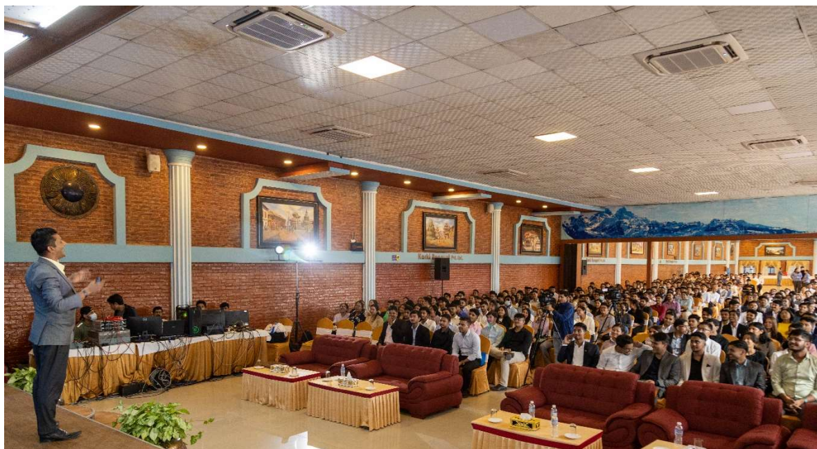
Glimpse of 6 th Batch of Pre Articleship-Orientation Program organized in Kathmandu.

The purpose of this orientation program was to enhance the skills and capabilities of students going to pursue three years articleship training by providing proper orientation and training on personality development, communication skills, professional behavior and culture at audit firms and clients' offices. The program was broadcast live in branch offices of ICAN for the students residing outside of Kathmandu Valley. Altogether 464 students participated physically while around 37 participated virtually.