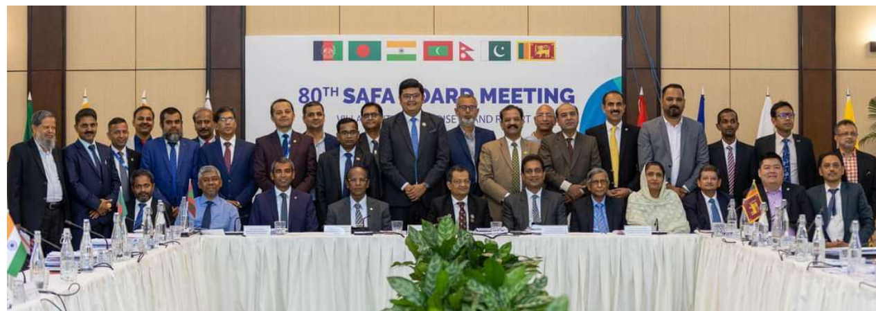
Glimpse of 80 th SAFA Board Meeting held in Maldives on 21 st August 2023