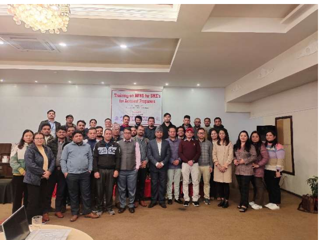
Glimpse of Training on NFRS for SMEs organized at Dhangadhi (Left) and Pokhara (Right)