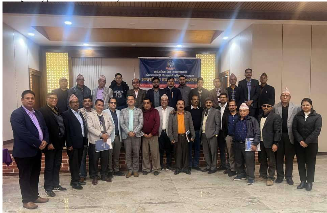
<u>Group Photo of participants in the Interaction Program along with President, Council Members, Members of Biratnagar, BCC, Executive Director, and Officials of the Institute</u>

Biratnagar Branch of the Institute organized an interaction program on "Role of Regulatory Authorities in Public Financial Management" with Governmental and Regulatory Agencies on 16<sup>th</sup> February 2024. The agenda of the interaction program was related with highlighting the role of Institute and need for regulatory coordination amongst the regulatory agencies for strengthening public financial management at province level and regulatory provisions to be abide by Members of the Institute.