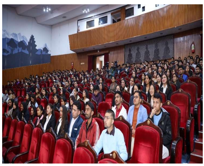
Glimpse of 7th Pre-Articleship Orientation Training in Kathmandu

The purpose of this orientation training program was to enhance the skills and capabilities of aspiring Chartered Accountants pursuing articleship training by providing proper orientation and training on personality development, communication skills and professional behavior and culture at audit firms and client's offices. This program was mandatory for all CAP II passed students for submission of their articleship deed to the Institute. The Institute also facilitated the students residing outside valley by providing virtual platform to participate in the program. The program was attended by 348 CAP II qualified students.