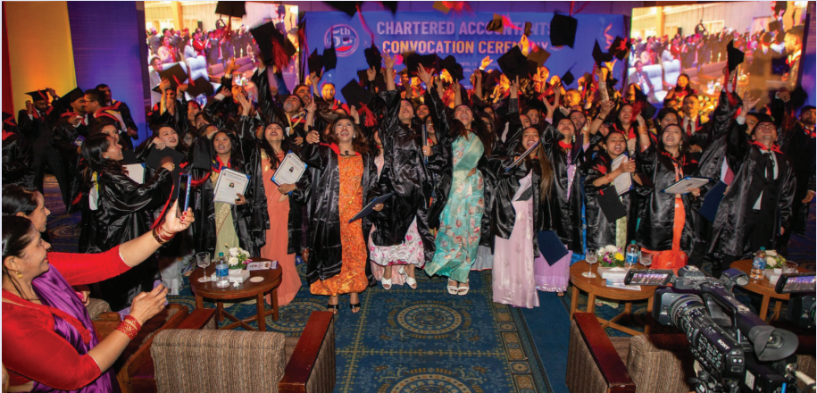
Figure: Recently Qualified Chartered Accountants Celebrating their Convocation Ceremony