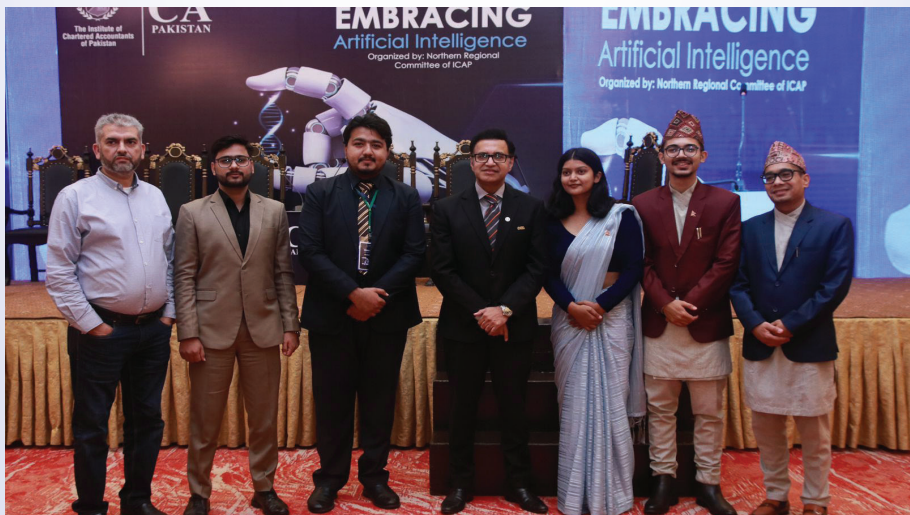
Figure : Students Participating in International Conference