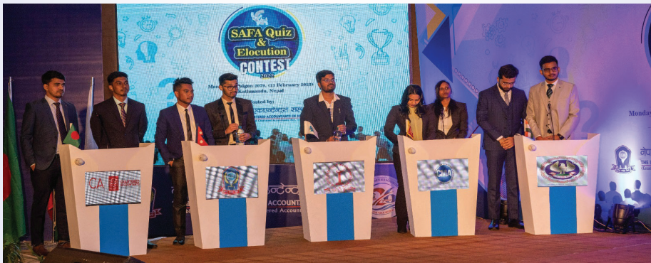
Figure: Students Participating in SAFA Level Quiz and Elocution Contest

Further, students of ICAN participate in various National and International Conferences organized by Professional Accounting Organizations of SAFA level i.e., India, Bangladesh, Pakistan and Sri Lanka.