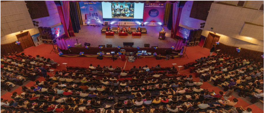
Figure: SAFA level International Students' Conference held in Nepal