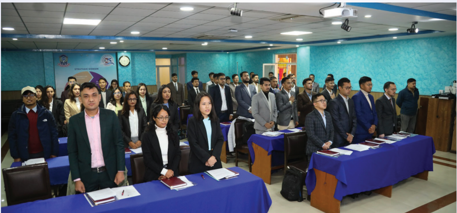
Figure: General Management and Communication Skills (GMCS) Training