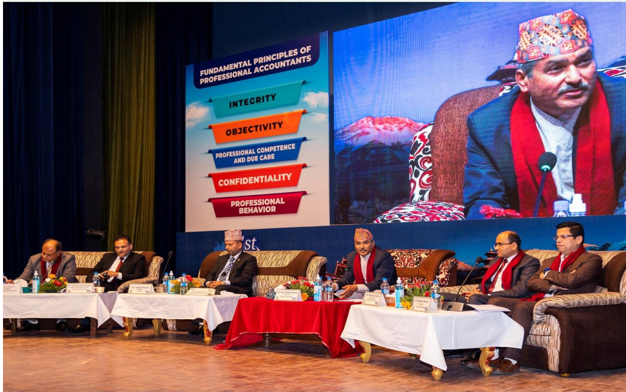
Governor, CA. Maha Prasad Adhikari addressing in the Panel Discussion on “Current Scenario of National Economy and Way Forward”