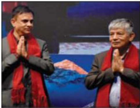
Veteran comedians Madan Krishna Shrestha (right) and Hari Bansha Acharya participating in an event in Kathmandu, on Wednesday. .....