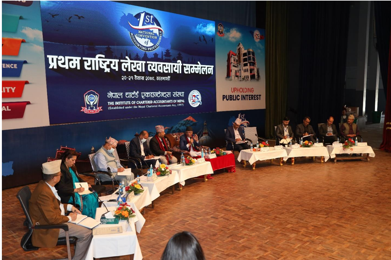
Panelist at Panel Discussion Session on “Role of Regulators in Upholding Public Interest”

During Panel Discussion, the panelist briefed about the major regulatory activities and procedures of their respective regulatory bodies and addressed the queries raised by the participants. The panel discussion was mainly concentrated with the policy level provision and legal arrangement related to the scope and dimension of work areas of every regulatory bodies. At the end of the panel discussion, it was concluded that all the regulatory bodies shall work within the limitation of their scope defined by the legislation and expressed commitment to work together for the development of national economy. And, President CA. Yuddha Raj Oli presented token of love to all the panelist.