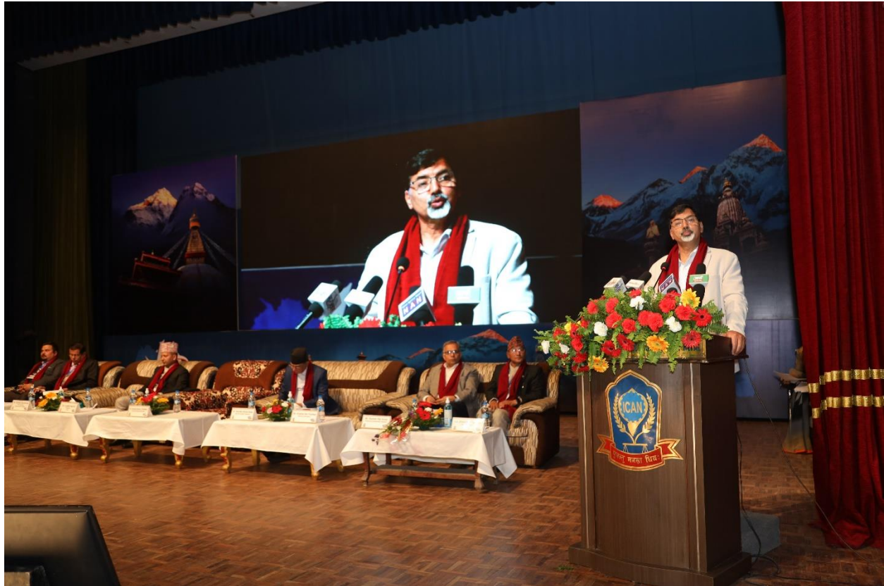
Hon’ble Finance Minister, Mr. Janardan Sharma “Prabhakar” addressing the Program