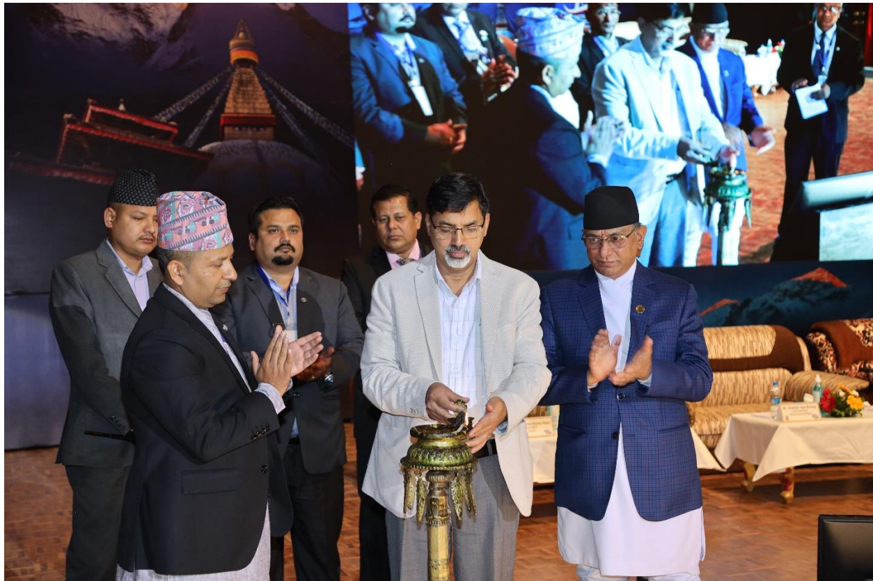
Hon’ble Finance Minister, Mr. Janardan Sharma “Prabhakar” inaugurating the program by lightening the lamp