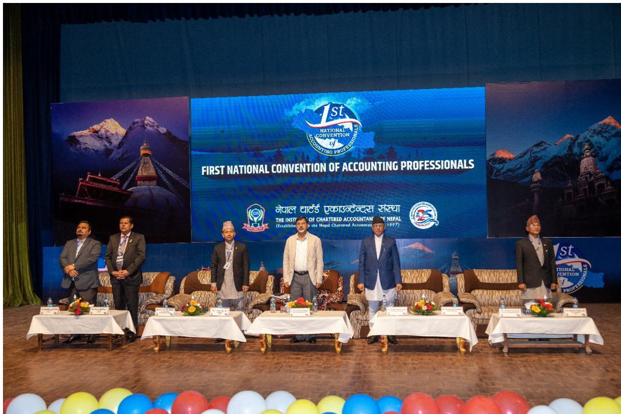
Chairperson, Chief Guest, Special Guest and Guest in the Opening Session of Convention