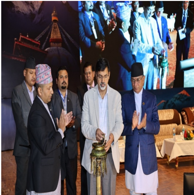
Hon'ble Finance Minister, Mr. Janardan Sharma “Prabhakar” inaugurating the program by lightening the lamp