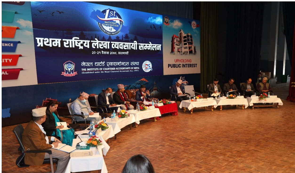
Panelist at Panel Discussion Session on “Role of Regulators in Upholding Public Interest”