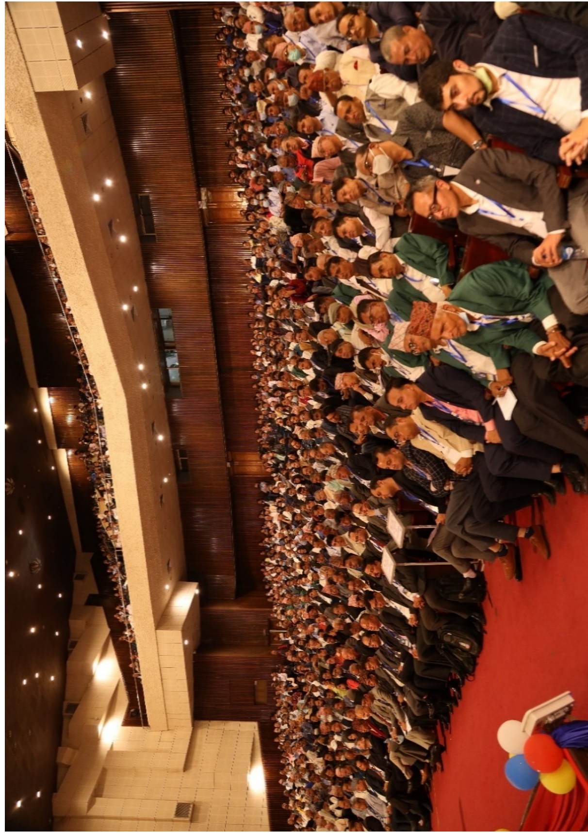
Participants at The First National Convention of Accounting Professionals