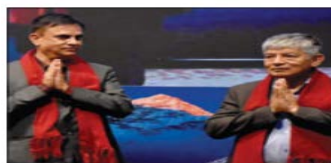
Veteran comedians Madan Krishna Shrestha (right) and Hari Bansha Acharya participating in an event in Kathmandu, on Wednesday.