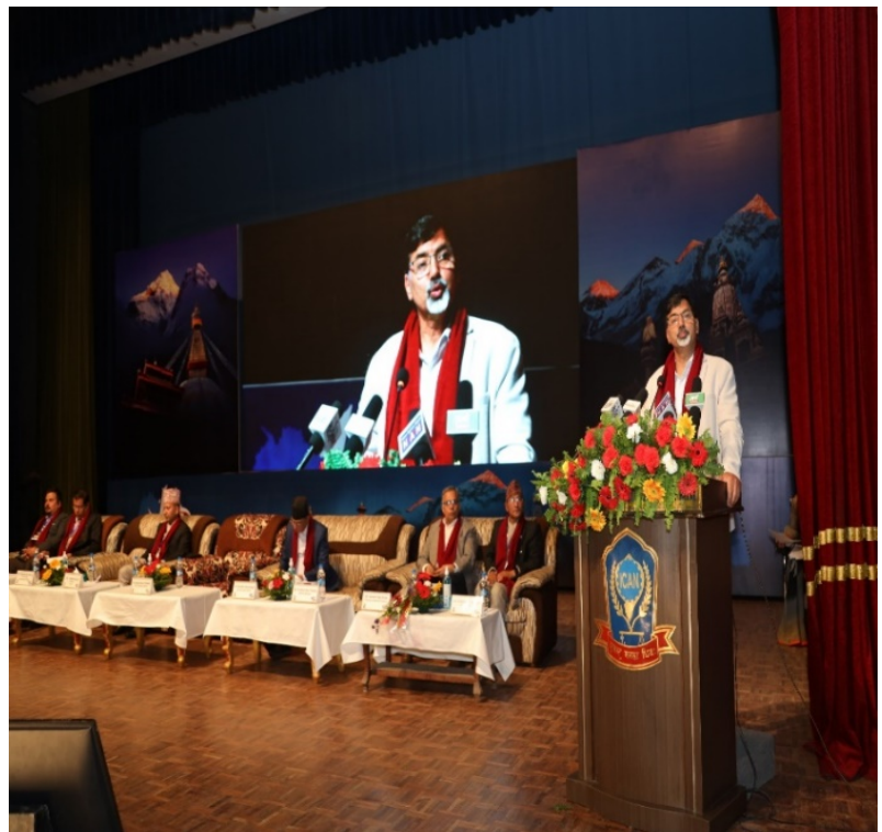
Hon'ble Finance Minister, Mr. Janardan Sharma “Prabhakar” addressing the Program

Hon'ble Finance Minister, Mr. Janardan Sharma “Prabhakar” addressed the program and commended the Institute for organizing the first convention of Accounting Professionals and congratulated the Institute for celebrating its 25 th Anniversary. During his address, he emphasized about the role and contribution of accounting professionals in national economy and stressed that the accounting professionals are the mirror of economy. Likewise, he urged accounting professionals to maintain financial discipline, professional ethics and to realize that their Integrity is inevitable for maintenance of national prosperity and sovereignty. Similarly, he also emphasized on need of proper accounting of natural resources of the Country.