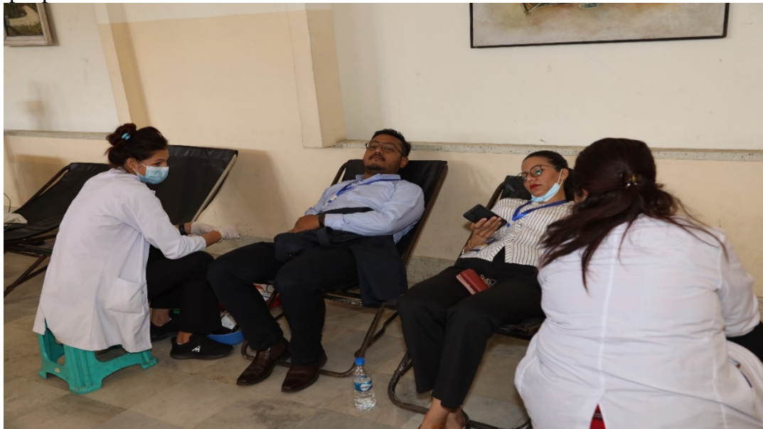
Blood donation campaign

Moreover, parallelly with the Convention, the Institute also organized a blood donation program and 69 people donated blood