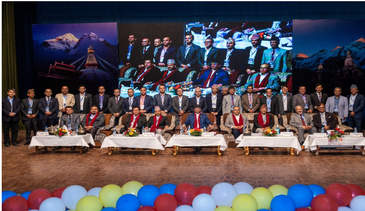
Group Photo of Chief Guest, Special Guest and Guest along with the Past Presidents, President, Vice President and Council Members in the opening session of the Convention